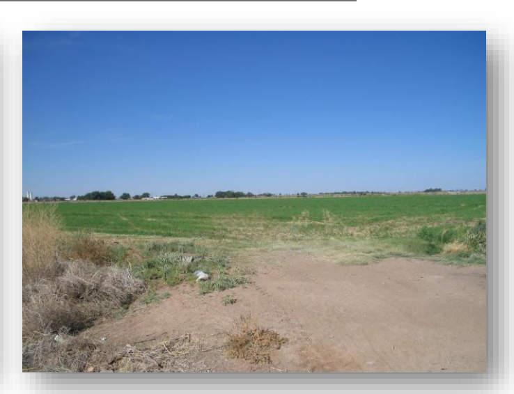
32 acre shovel ready parcel