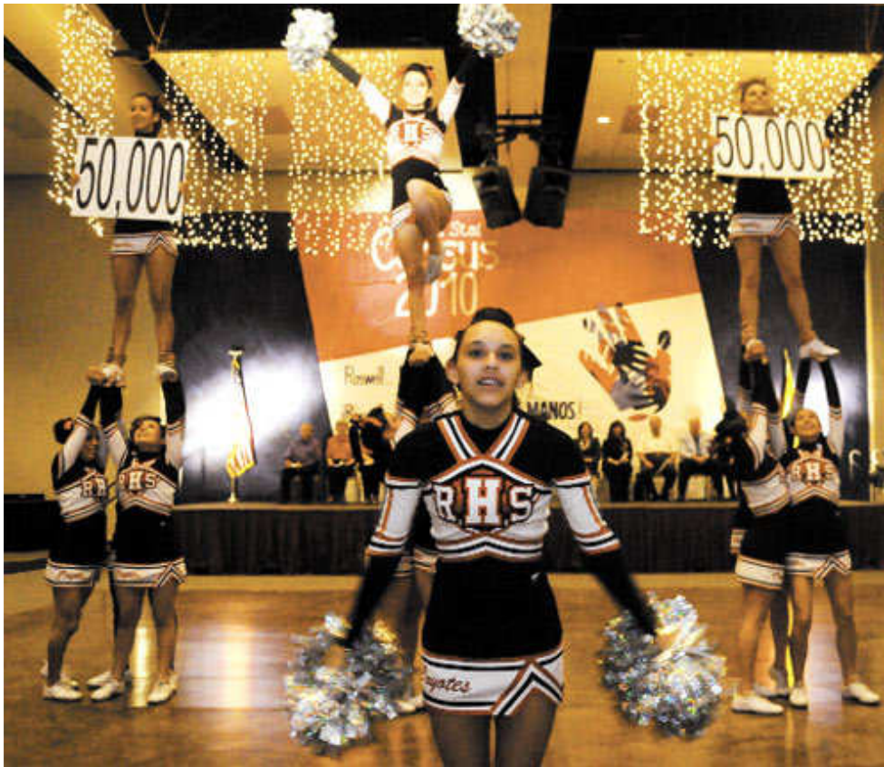
Roswell High school cheerleaders help jump start the 2010 Roswell Census Community Kick-Off held Tuesday at the Roswell Convention and Civic Center.